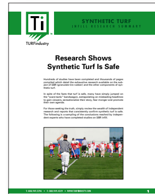
SBR Rubber Infill Summary

There are no independent or credible studies that conclude synthetic turf is linked directly, or indirectly, to health concerns: